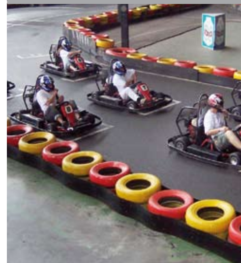
Fox Creek 2007 Christmas Party Go Karting Competition

The 2006 vintage has a complex bouquet of spicy ripe tobacco leaf with red cherry, black clove and aniseed. The sweet entry leads onto a solid rich mid palate with generous flavours of juicy blackcurrant and raspberry fruits. A refreshing style with evident tannins that are not obtrusive. Will drink well to 2012.